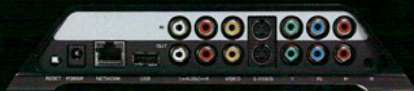
Slingbox Solo, $180 at J&R Music and Computer World, 23 Park Row, nr. Beekman St.; 212-238-9000.