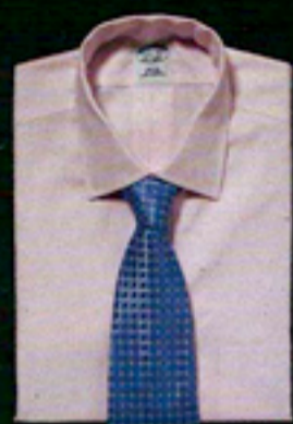
Cotton shirt, $79.50, and silk tie, $115, at Brooks Brothers, 346 Madison Ave., nr. 44th St.; 212-682-8800.