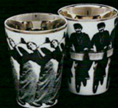
Shot glasses, $61 at Just Scandinavian, 161 Hudson St., nr. Laight St.; 212-334-2556.