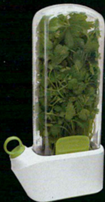
Prepara Herb Savor, $30 at Sur La Table, 75 Spring St., nr. Crosby St.; 212-966-3375.