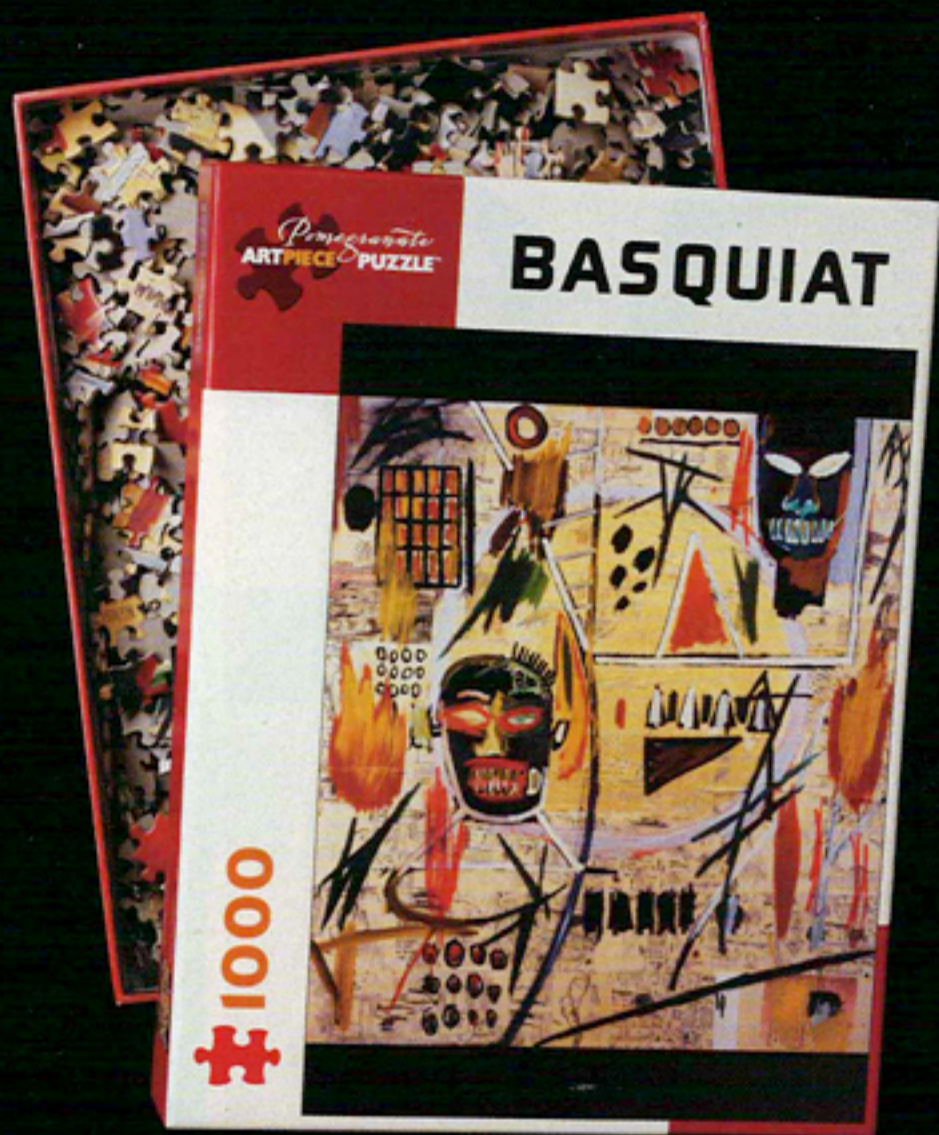
Basquiat puzzle, $17.95 at the Brooklyn Museum Shop, 200 Eastern Pkwy., nr. Washington Ave., Park Slope; 718-501-6258.