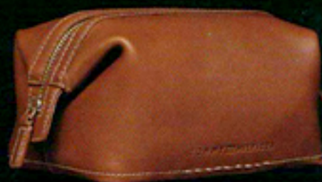
Tommy Hilfiger travel kit, $45 at Macy's, 151 W. 34th St., nr. Broadway; 212-695-4400.