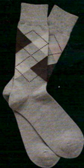
Argyle socks, $3.90 at Uniqlo, 546 Broadway, nr. Prince St.; 917-237-8800.