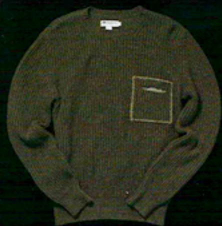
Tretorn sweater, $265 at Hus, 11 Christopher St., nr. Gay St.; 212-620-5430.