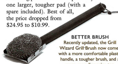
BETTER BRUSH Recently updated, the Grill Wizard Grill Brush now comes with a more comfortable plastic handle, a tougher brush, and a more appealing price tag.

It's been five years since we crowned the Grill Wizard Grill Brush the ultimate instrument for cleaning gunked-up grill grates, and it remains our favorite. Recently it's been retooled: The 14-inch wood handle now has a lighter-weight polypropylene grip, and the two stainless steel mesh scrubbing pads have been replaced by one larger, tougher pad (with a spare included). Best of all, the price dropped from $24.95 to $10.99.