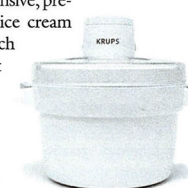
CREAM OF THE CROP The Krups Automatic Ice-Cream Maker churned out smooth, creamy ice cream.

We tested seven inexpensive, pre-frozen, canister-style ice cream makers to identify which made the best dessert with the least amount of work. After 30 minutes, machines with revolving beaters—by Krups ($29.99), Hamilton Beach ($36.17), and the stand mixer attachment from KitchenAid